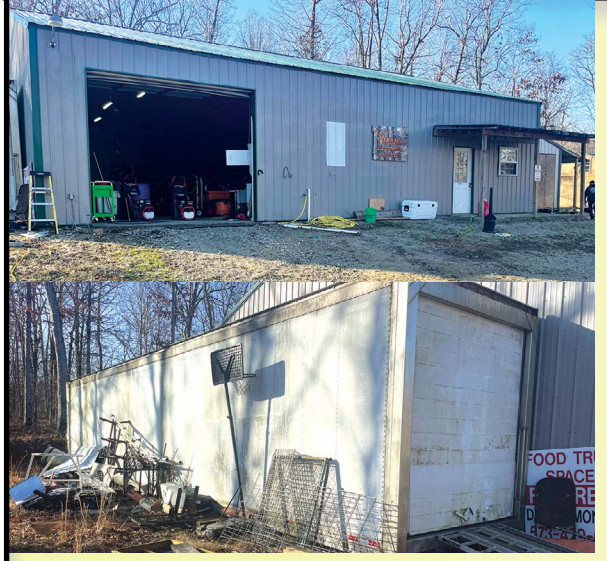
ERMS ON REAL ESTATE: 10% Down Day of Auction • NO Buyers Fee Taxes Will Be Prorated to Date of Closing. Title Insurance will Be Split 50/50 Between Buyer and Seller. Seller to Furnish General Warranty Deed. Possession Will Be at Closing

SATURDAY MORN February 24, 2024 10:00 A.M. Rain or Shine Terms on Real Estate: See Below